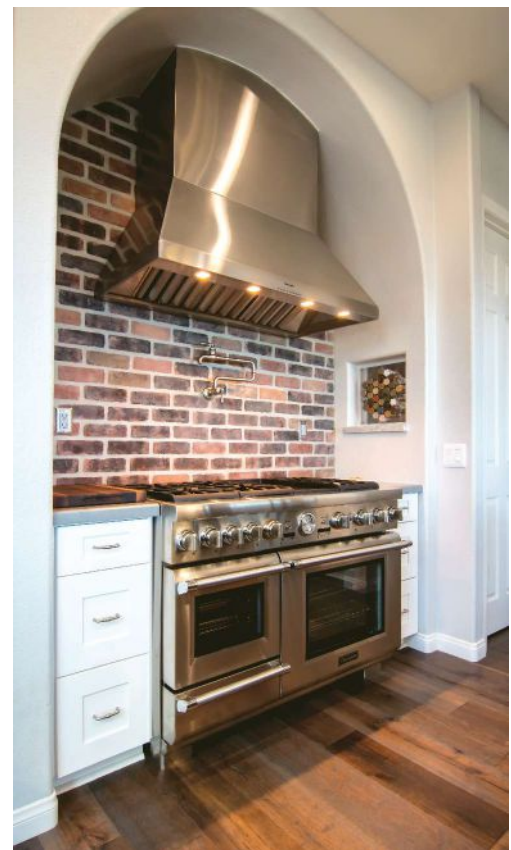
The cooking alcove serves as a major 'wow' factor, featuring a Thermador dual-fuel range with steam oven, quartz-lined niches and recycled brick backsplash.

The designer's clients selected the Thermador appliances – including the dual-fuel range with steam oven, 180-bottle wine cooler column, freezer and refrigerator columns, vent