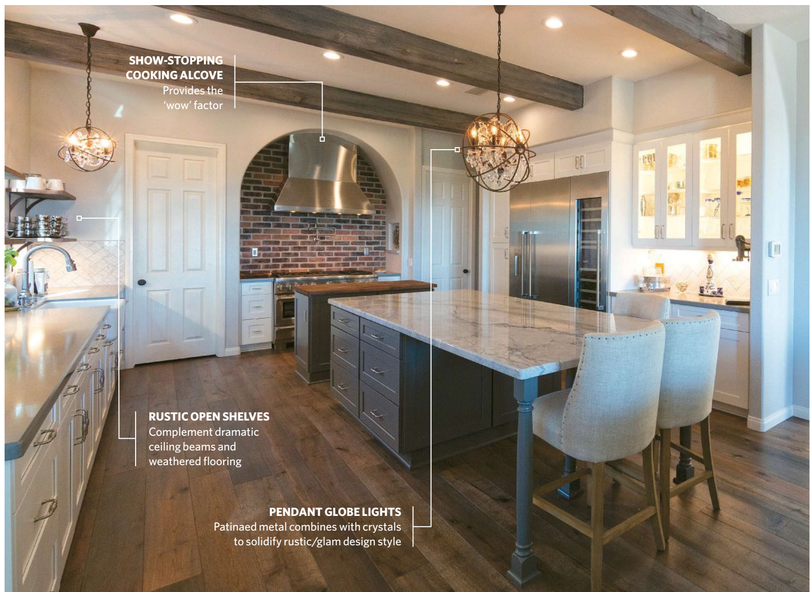
SHOW-STOPPING COOKING ALCOVE Provides the 'wow' factor

As a complement, they incorporated Super White Quartzite on the large 'eating/entertainment' island. It serves as a glamorous element while offering a lot of visual movement. "Quartzite is beautiful, but it takes a bit more maintenance," the designer notes. "It needs to be sealed and isn't quite the workhorse of quartz so we used it on the eating/entertaining island. It's the 'beauty' while quartz is the 'beast.'"