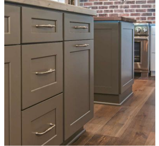
↑ Two islands improve the kitchen's functionality by providing separate work and gathering/entertaining spaces.

As such, the designer added a slim cabinet between the washer and dryer, repeating the same materials from the kitchen, including the charcoal gray cabinets and gray quartz countertops. A pantry-style cabinet was also added to the opposite wall, while a second one was placed between the laundry room and kitchen to serve as overflow storage for both spaces. ■