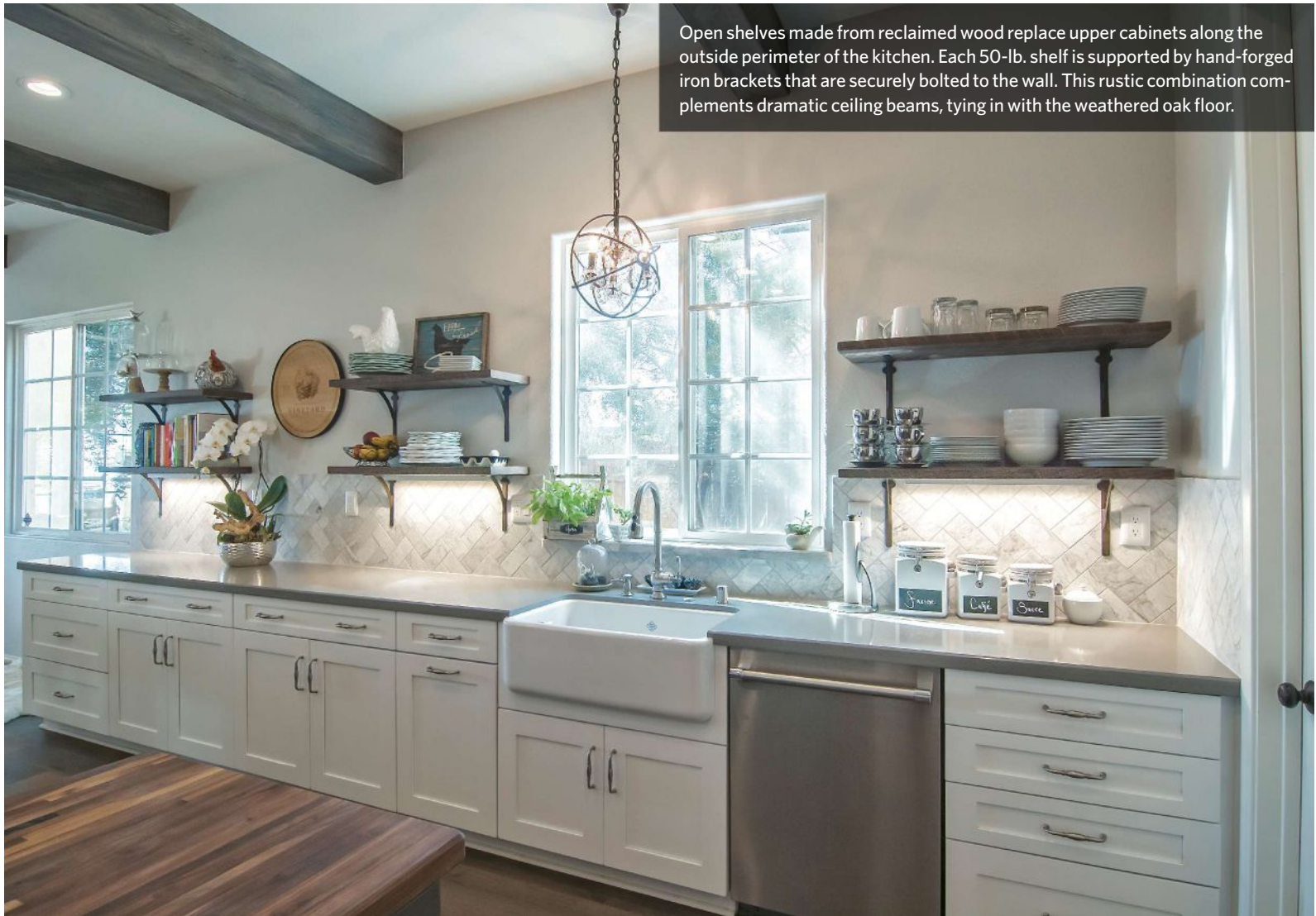
Open shelves made from reclaimed wood replace upper cabinets along the outside perimeter of the kitchen. Each 50-lb. shelf is supported by hand-forged iron brackets that are securely bolted to the wall. This rustic combination complements dramatic ceiling beams, tying in with the weathered oak floor.

Dark walnut butcher block on the small island fulfills the client's desire to include wood. "She really likes the richness of wood, and it was important to her that it be included in the design," says the designer.