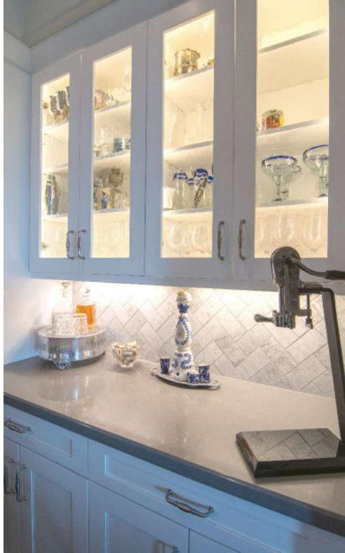
↑ Glass cabinet doors are illuminated to showcase contents and marble laid in a herringbone pattern serves as the backsplash.

"We knocked down some walls to make better use of some wasted space in the existing laundry room, reconfiguring both footprints to